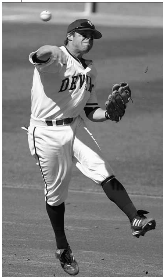
Shortstop Dustin Pedroia was a three-time All-Pac-10 selection.